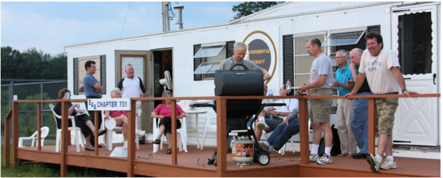
The 701 gang enjoying a beautiful summer evening...