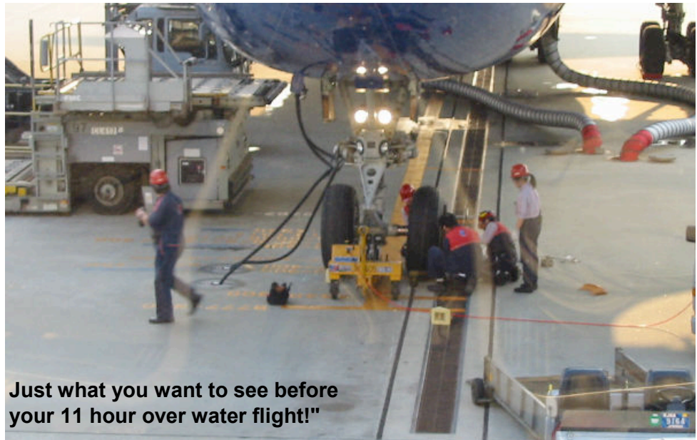
Just what you want to see before your 11 hour over water flight!"

Lastly, there is the Holiday Party. This one is just about having fun. Family, friends, food and flying... the party is always a good time. Please take the time if you can to join us at the party. What better way to end what has been a very good year? Hope to see all of you there!